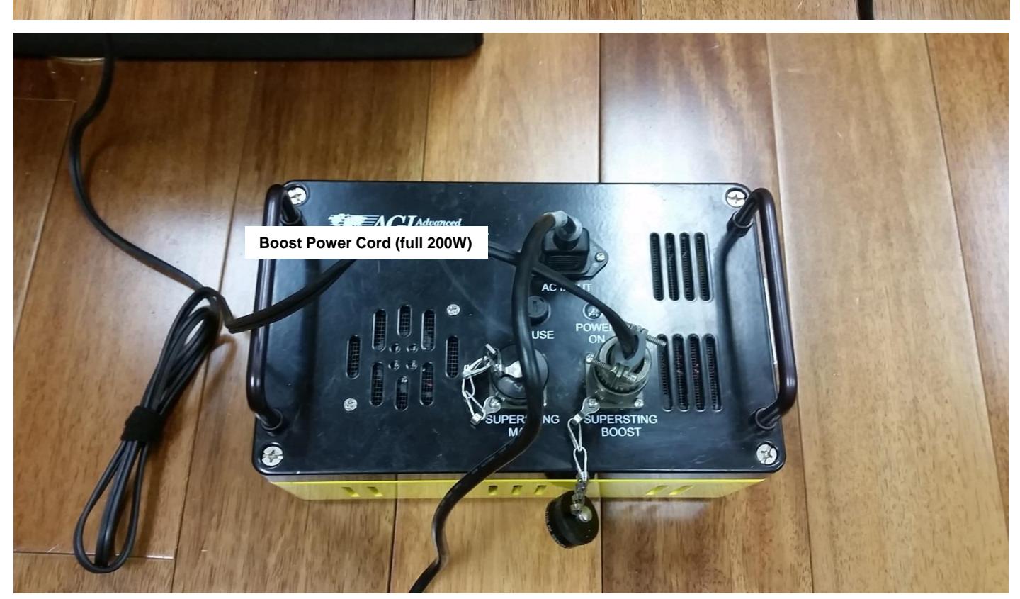
Copyright © by Advanced Geosciences. All rights reserved. This publication, or parts thereof, may not be reproduced in any form without written permission of Advanced Geosciences, Inc.